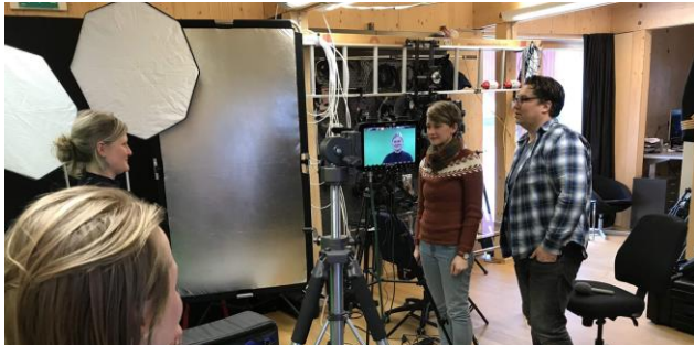
Learning how to create video portraits. Aurora Borealis Multimedia. April 2019