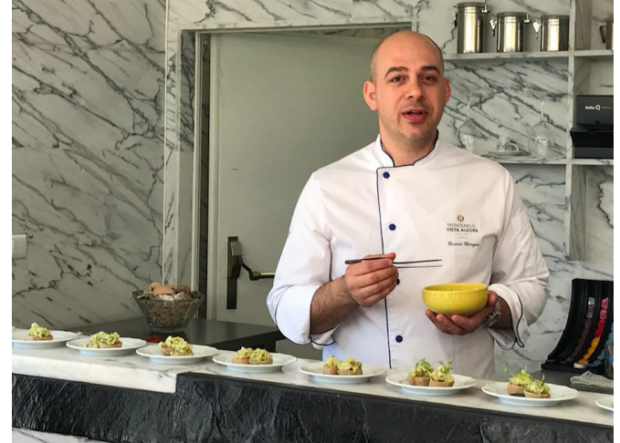
Bacalhau in Portugal - 1000 recipes. March 2019