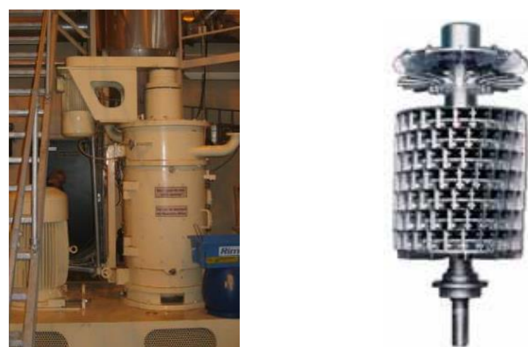
Figure 1: Mill dryer with ultra-rotor for simultaneous milling and drying

Frozen milt from Norwegian spring spawning herring was partly thawed overnight at 5 °C and heat treated in a tube cooker. Antioxidant was added and the product dried in a Jäckering hot air mill dryer (Figure 1).